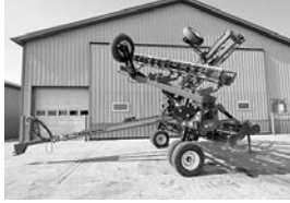
Unverferth 1245 34' rolling harrow , dbl. rolling baskets, X-fold, 12' base, $16,900.