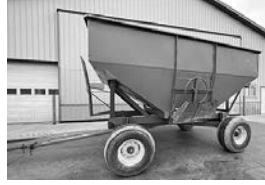
Parker 2500 gravity box , on JD running gear, gravity wagon, $1,500.