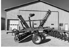
Krause 1587 18' rock flex disc , very good blades, rear hitch & hyd., $5,900.