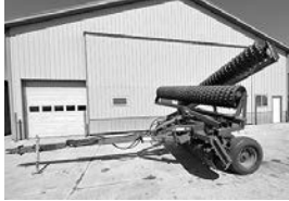
Brillion X108 27' cultipacker , solid notched V-whls., new tires, $13,900.