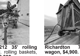
J&M TF 212 35' rolling harrow , dbl. rolling baskets, new tires, $9,900.