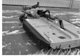
Woods S106 3-pt. ditch bank mower , PTO drive, $7,900.