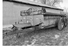
NI 245 manure spreader , tdm. axle, truck tires, slop gate, $3,900.