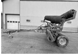
Brillion X108 25' cultipacker , solid notched V-whls., new tires, $13,900.