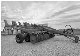
Sunflower 4212 11-shank disc chisel plow , hyd. adj. discs, new tires, $18,900.