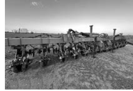
Hiniker 6000 12R28\"/>