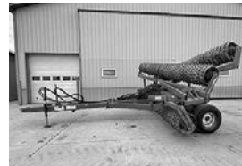
Brillion XL144 36' cultipacker , solid notched V-whls., new tires, $18,900.