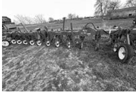
JD 886 12R30' row crop cult. , hyd. fold, 3-pc. sgl. sweep, $9,900.