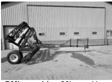
DMI crumbler , 20' round bar, sgl. basket roller, $3,900.