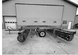
Brillion ML 2253 18'9\"/>