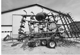
JD 980 30-1/2' field cult. , 5-bar spike leveler, rear hitch & hyd., $14,900.