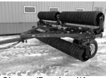
Glencoe/Farmhand/Agco Model 42 25' cultipacker , solid notched ductile whls., new tires, $9,900.