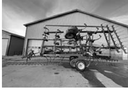
JD 2210 24-1/2' field cult. , 3-bar coil tine leveler, factory rear hitch & hyd., $19,900.