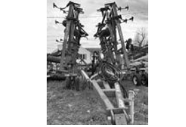
Sunflower 5034 29-1/2' field cult. , 5-bar spike leveler, rear hitch & hyd., $14,900.