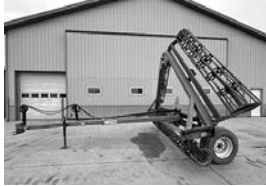
DMI 25' crumbler , round bar sgl. basket roller, $7,900.