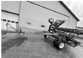
Unverferth 1225 28' rolling harrow , dbl. rolling baskets, whl. on wings, large bearings, spike harrow, very low acres, $14,900.