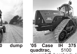
Richardton 700 dump wagon , $4,900.