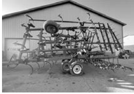
JD 980 24-1/2' field cult. , 5-bar spike leveler, rear hitch & hyd., $12,900.