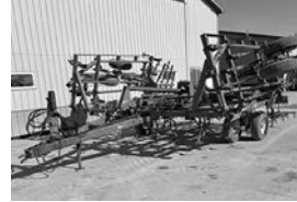
JD 980 25-1/2' field cult. , 150 lb. heavy duty shanks, 5-bar spike leveler, rear hitch & hyd., $12,900.