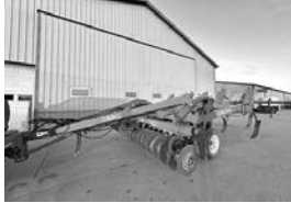
Sunflower 4212 9-shank disc chisel plow , hyd. adj. discs, rear S-tine leveler, $15,900.