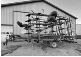
Sunflower 5035 28-1/2' field cult. , 3-bar spike leveler, Richmond 7' sweeps, $16,900.