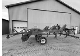
Sunflower 4212 7-shank disc chisel plow , S-line & buster bar leveler, hyd. adj. discs, $15,900.