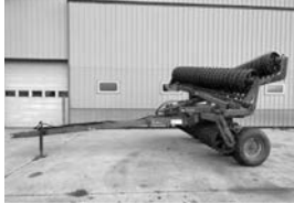
Brillion X108 25' cultipacker , solid notched ductile whls., scrapers, new tires, $14,900.