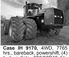
Case IH 9170 4WD , 7765 hrs., bareback, powershift, (4) hyd. outlets, 900/50R42 frt., 750/65x38 duals, $44,900.