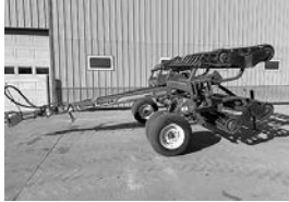
Unverferth 1225 22' rolling harrow , dbl. rolling baskets, large bearings, spike leveler, low acres, $11,900.