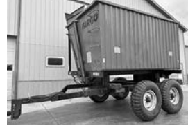
Fargo 1585 dump cart , tdm. axle, truck tires, 11'3\"/>