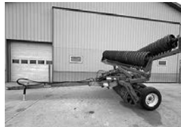
Brillion X108 27' cultipacker , solid notched ductile whls., scrapers, new tires, $16,900.