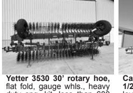
Yetter 3530 30' rotary hoe , flat fold, gauge whls., heavy duty spg. kit, less than 600 acres, $14,900.