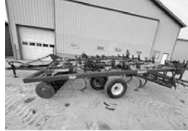
Landoll 875 15' Till-All soil finisher , good discs & blades, knock on sweeps, (2) new tires, $6,900.