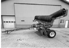
Brillion X108 27' cultipacker , solid notched ductile whls., scrapers, like new, new tires, $17,900.