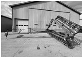
DMI 30' crumbler , round bar sgl. basket roller, $7,900.