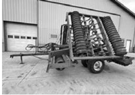
Brillion WM-3002 25' cultimulcher , solid notched V-whls., frt. & rear scrapers on rear, $16,900.