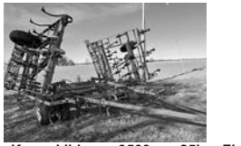
Kongskilde 3500 25' S-tine field cult. , dbl. rolling baskets, new Richmond 4 sweeps, new tires, $9,900.